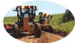
Rebuilding & Rehabilitating