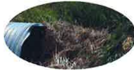
Culvert Maintenance & Replacement